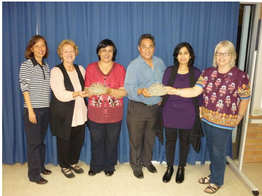
TIMS Committee Members holding the Multicultural Regional Community Award and the Cultural Diversity Ambassador Award.