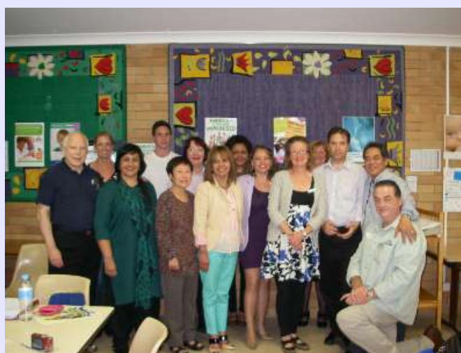
Pic above: TLC Festival management committee members.

TIMS was once again successful in getting the Multicultural Affairs Queensland (MAQ) Cultural Festivals grant of $11,000 for the Toowoomba Languages and Cultures (TLC) Festival 2013. MAQ recognises the Festival as a signature event and has committed to giving $12,000 for 2014 and 2015 festivals.