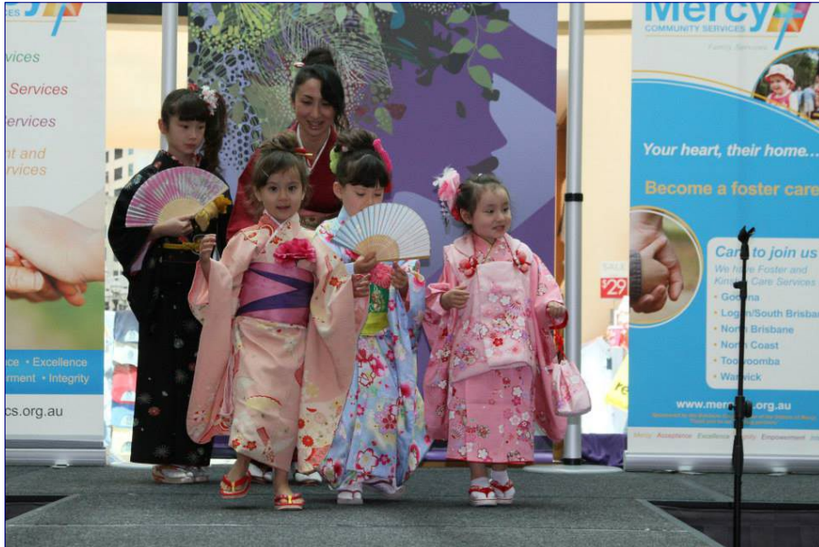
Above: The Japanese kids in their traditional outfits stole the show with their gorgeous smiles. Below:: Crowds throng to watch the Fashion show at Grand Central.

Hailed as one of the most joyous events the third International Fashion show attracted bigger than ever crowds. Participants from over fifteen communities proudly showcased their traditional attire at the event organised by Mercy Community Services in partnership with Grand Central Shopping Centre and TIMS.