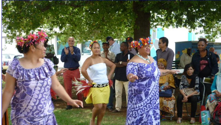
Above Pacific Island dancers perform on the village green.

TIMS partnered with TRC, Carers Qld and many other service organisations to host Harmony Day celebrations at the Village Green.