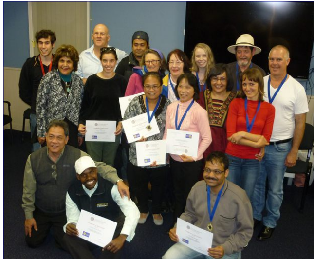
Above: Festival volunteers at the Volunteer Appreciation Celebration.