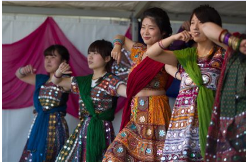
Above: USQ students performing at the TLCFFestival.