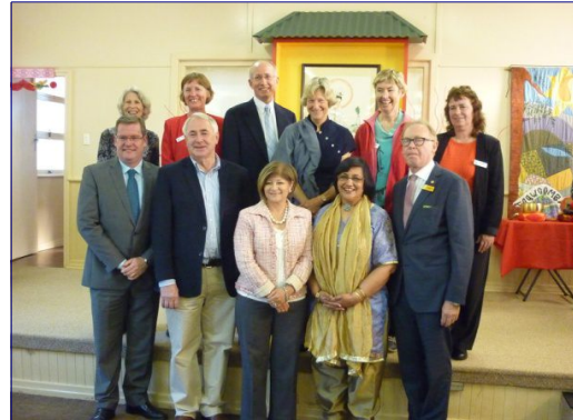
Celebrating 25 years of the Toowoomba Taoist Society with dignitaries.