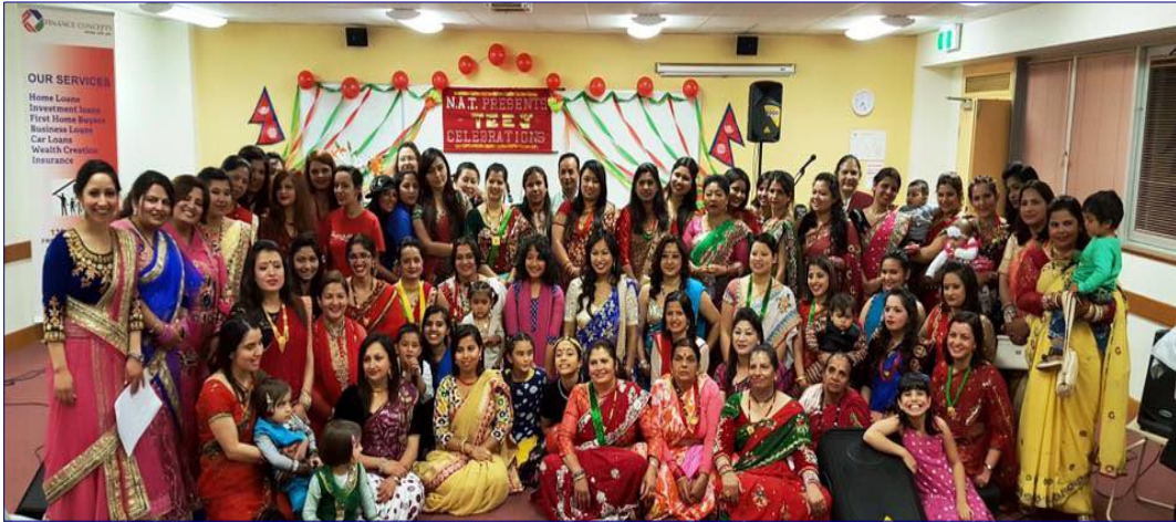
Photo: Nepalese Teej Program on 12 September 2015

On the occasion of Haritarika Teej (a great Nepalese women's festival), the Nepalese community celebrated the Teej program on 12 September 2015 attended by Nepalese community members in Toowoomba and surrounding areas. The Nepalese Association of Toowoomba (NAT) organised the program at a hall at USQ. Cultural songs, classical and modern dances and dances to Teej songs were performed on the occasion. More than one hundred fifty Nepalese community members participated in the program.