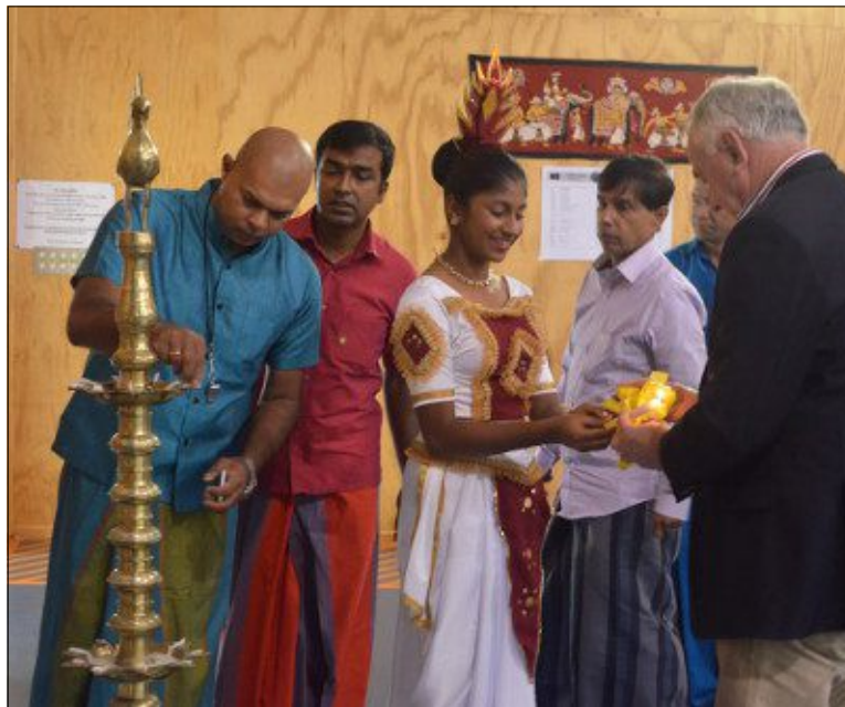
Lighting the Lamp ceremony at the Sri Lankan New Year Celebrations in April.