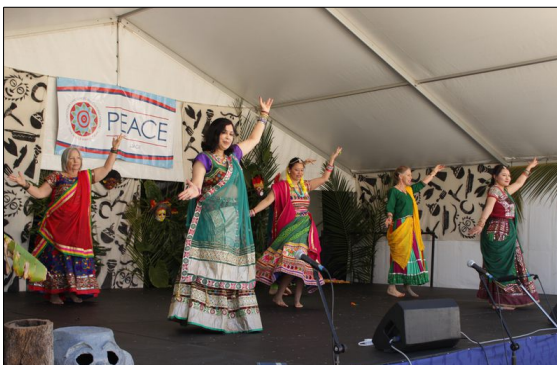
Bollywood Belles performing at the Festival.