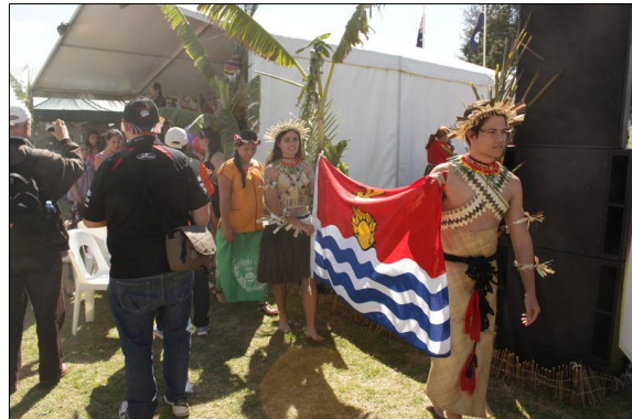
Pasifika Toowoomba held a Parade of Nations for the official opening.