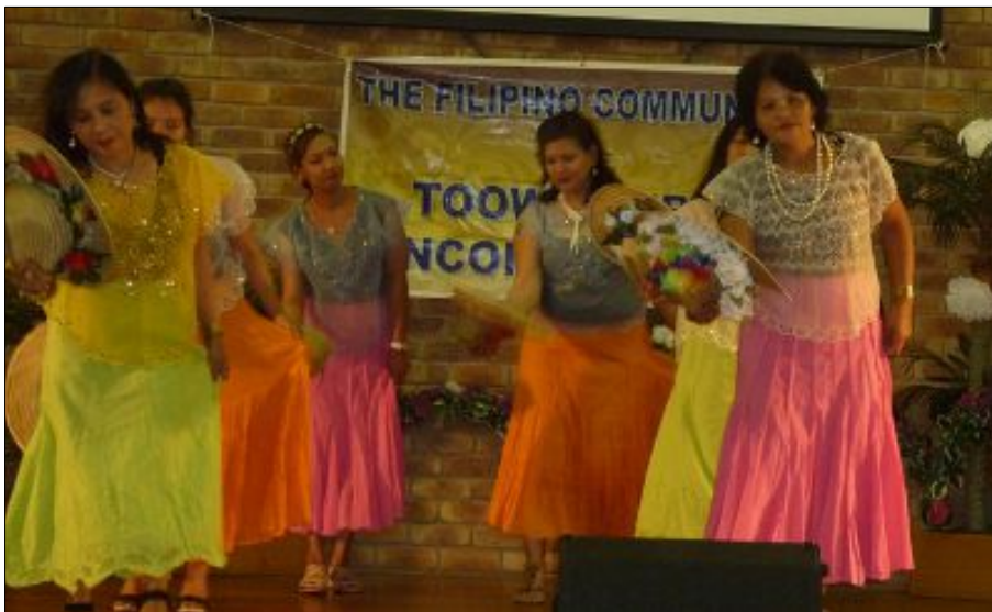
The Filipino Dance Group performing at the Flores De Mayo Mother's Day event.

The Filipino community continued their fundraising work for local charities. Filipino kids group the Dancing Angels and the Filipino Dance group also participated in the Toowoomba Languages & Cultures Festival.