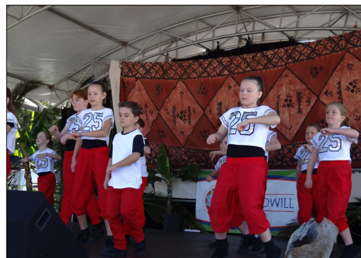
School children performing on the Goodwill Stage.