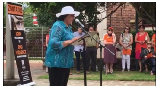
Human Rights Day Flag Raising ceremony organised by the Zonta International Women's Club on 10 Dec 2015 at the Village Green.