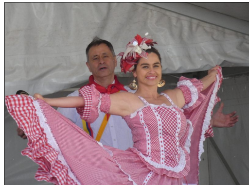
Colombian Dance Group