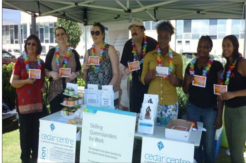
Above: TIMS celebrated HOLI – the Indian Festival of Colours emphasising harmony in diversity at the Harmony in the City function this year. The Cedar Centre students helped design the card (pic overleaf). Colourful 'malas' (garlands) were distributed to the audience along with the Happy Holi Greeting card.