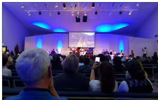
The Ezidi Group commemorated the tragic genocide of their members on 3 August at the Humeridge Church.