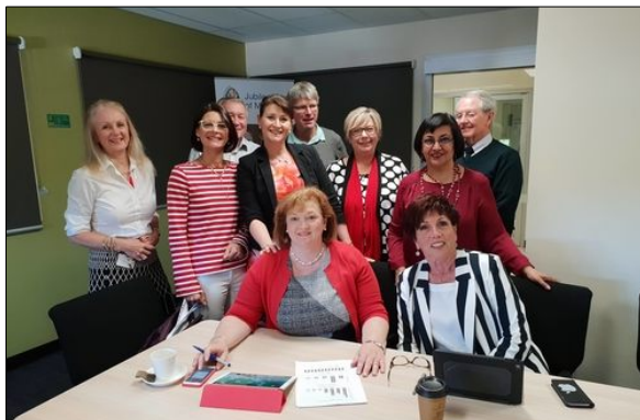
St Vincent's Hospital Regional Advisory Committee