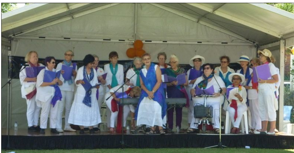
Above: Women In Harmony performing at the Harmony Day function.