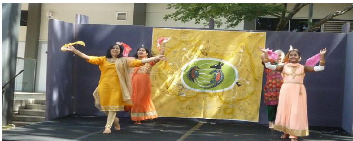
Above: Bollywood Belles performing at the USQ Harmony Day function.