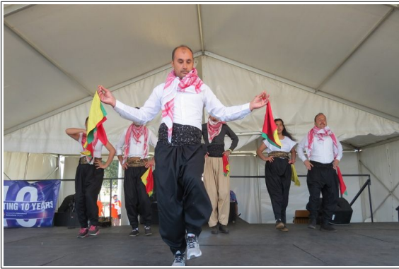
The Rojava Dance Group performing a Kurdish dance.