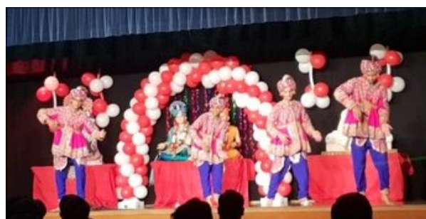
The Janamashtami celebration held in Toowoomba by the Swami Narayan group