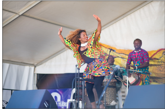
African Fusion had the crowds on their feet dancing.