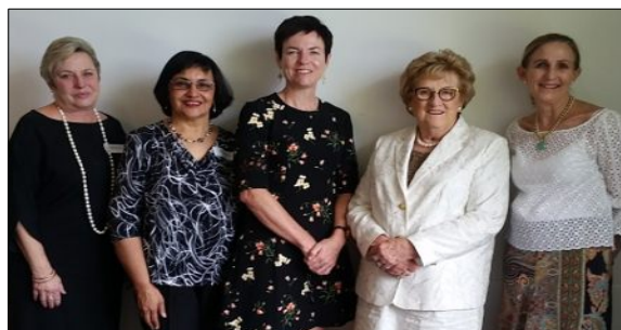
Zonta International Women of the year 2014-2018 at their International Women's Day lunch.