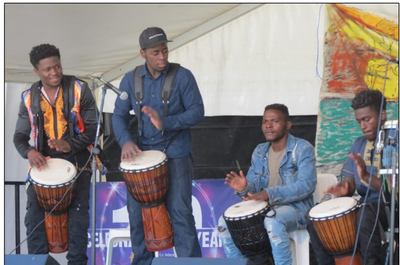
Kelele Boys Drumming Group tapping Congo beats.