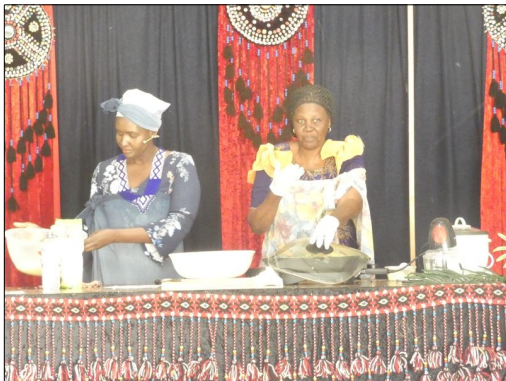
African food cooking demonstration.