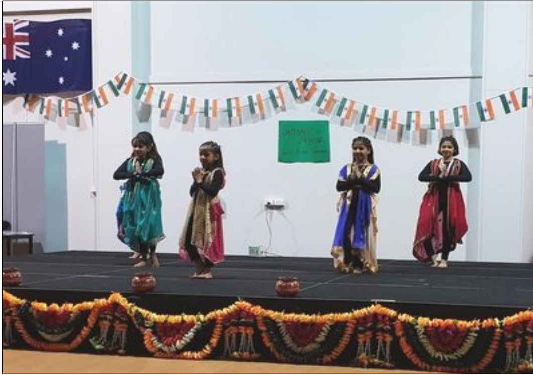
Pic above: Indian kids performing at the Indian Independence Day 71 th Anniversary celebrations. Below: The Indian community celebrating Vaisakhi.