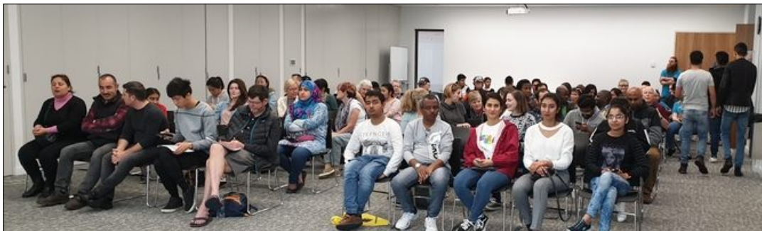
Pic above – at the volunteer training session held the week before the Festival.

The TLCF Volunteer and Sponsor Appreciation Party: was held on 14 September. The festival had a record number of volunteers this year with over 160 people registering. See cover for the group photo at the Volunteer Thank you function.