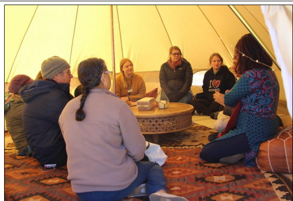
MDA presented stories, coffee and music from recent migrants at The Living Book Teepee.