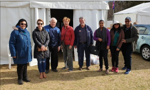
Volunteers setting up on the Saturday before the TLC Festival.