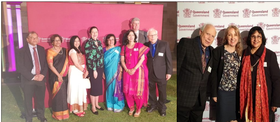
Above: Premier's receptions for the Indian community (left); Multicultural Month Celebration (right).