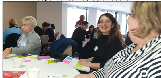
Refugee Migration Roundtable organised by Regional Development Australia