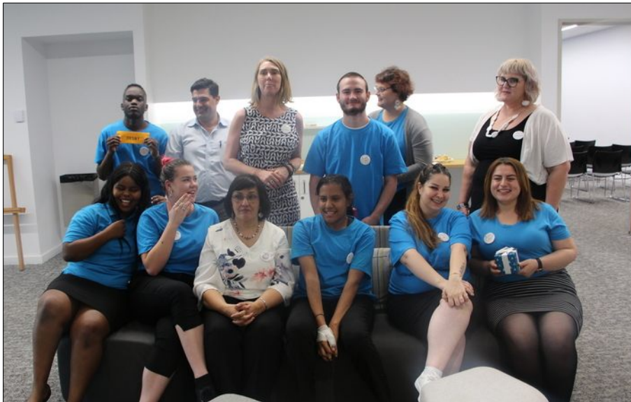
Above and Below: The Diversity Project trainees for terms 1 and 2.

The Diversity Project is a partnership between TIMS and the CEDAR Centre's flagship traineeship project under the Skilling Queenslanders for Work Scheme run by the Queensland State Government. Under this programme two intakes of 10 trainees each gained experience through a 20 week programme giving the trainees experience in business admin working on TIMS projects. Planning the Job Assist Career Expos is a significant component of the traineeship programme. The trainees also helped with the Toowoomba Languages & Cultures Festival.