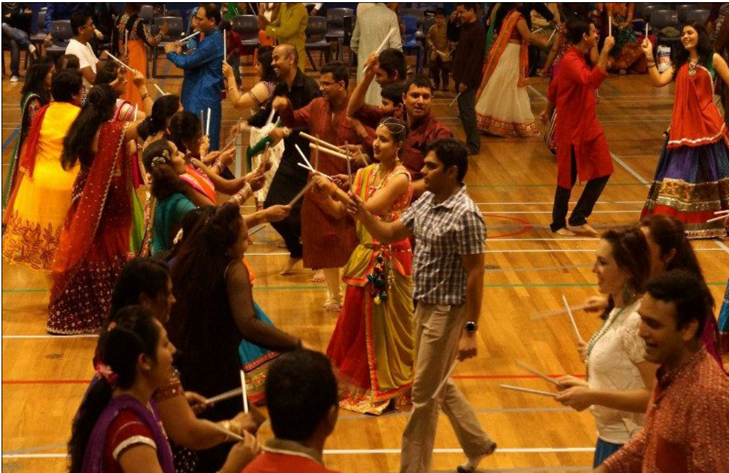
Pics Above: Members of the Jay Jay Girva Gujarat Group celebrating the Festival of Navratri with traditional Dandiya and Garba dances.