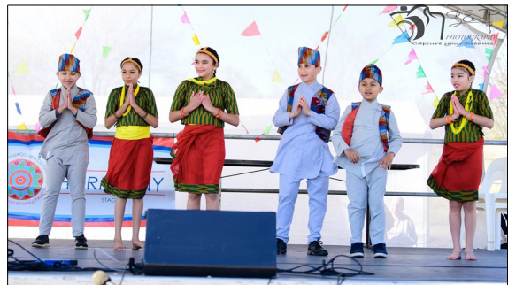
Left and above: The Nepalese Community joined by their Brisbane friends wowed the audiences with their never seen before traditional performances.