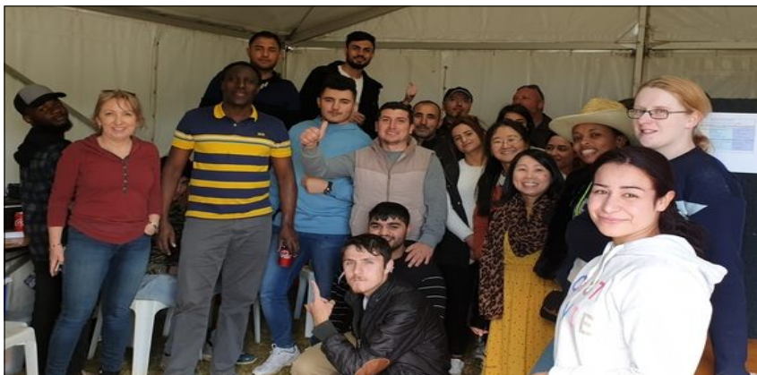
Volunteers stopping for a lunch break while setting up for the TLC Festival

Friends and Volunteers: A very big and special thank you to the hundreds of friends and volunteers who help us each year with our projects. Their friendship and efforts have enabled us to deliver such a range of successful projects every year.