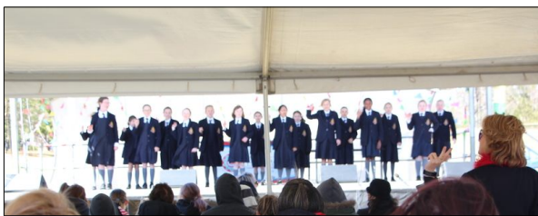
Above and right: over 500 children performed.