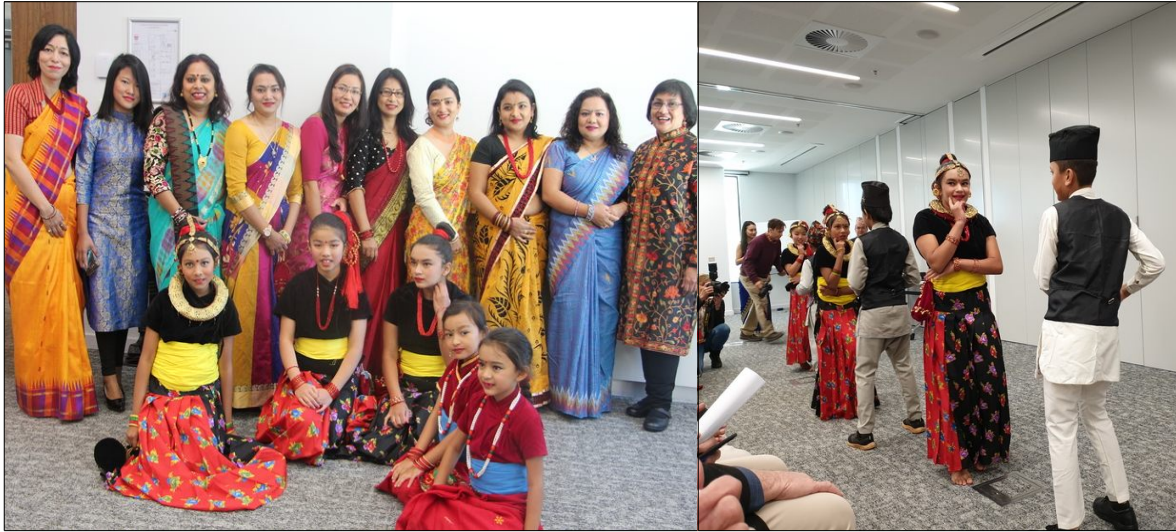
Pics above: The Nepalese Community at the Media Launch of the Toowoomba Languages & Cultures Festival in May. Below: The Nepalese Community celebrating Teej at the USQ Refectory Hall.