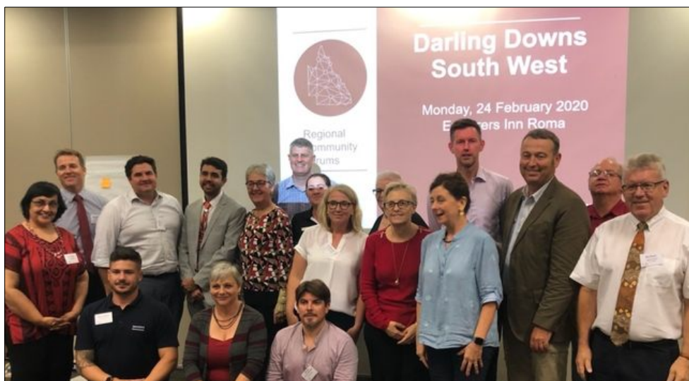
Below: Forum members from all parts of the Darling Downs South West Region.