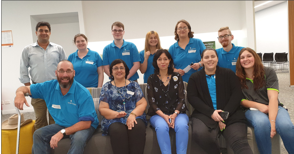
Above and Below: The Diversity Project trainees for terms 1 and 2.

The Diversity Project ran for a second year. The program is a partnership between TIMS and the CEDAR Centre's flagship traineeship project under the Skilling Queenslanders for Work Scheme run by the Queensland State Government. Under this programme two intakes of 10 trainees each gained experience through a 20 week programme giving the trainees experience in business administration working on TIMS projects. Planning the Job Assist Career Expo and Information Sessions are a significant component of the traineeship programme.