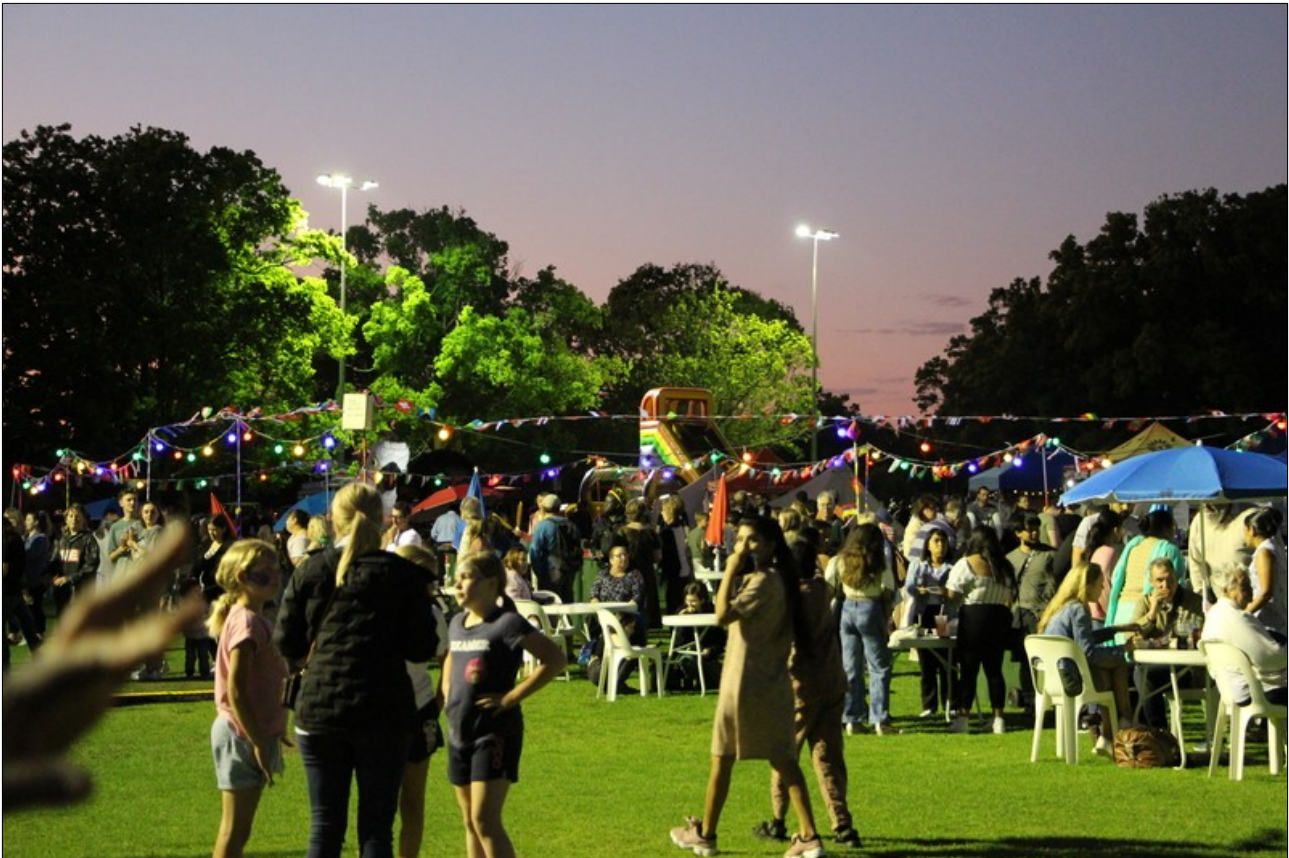
The event ran from 3.00 – 8.00 pm. A program of 30+ non-stop performances was closed with a fireworks display. Performances kept the audience enthralled till the very end.