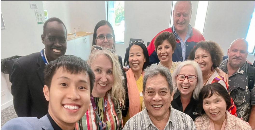
Below: TIMS members at the AGM 2021