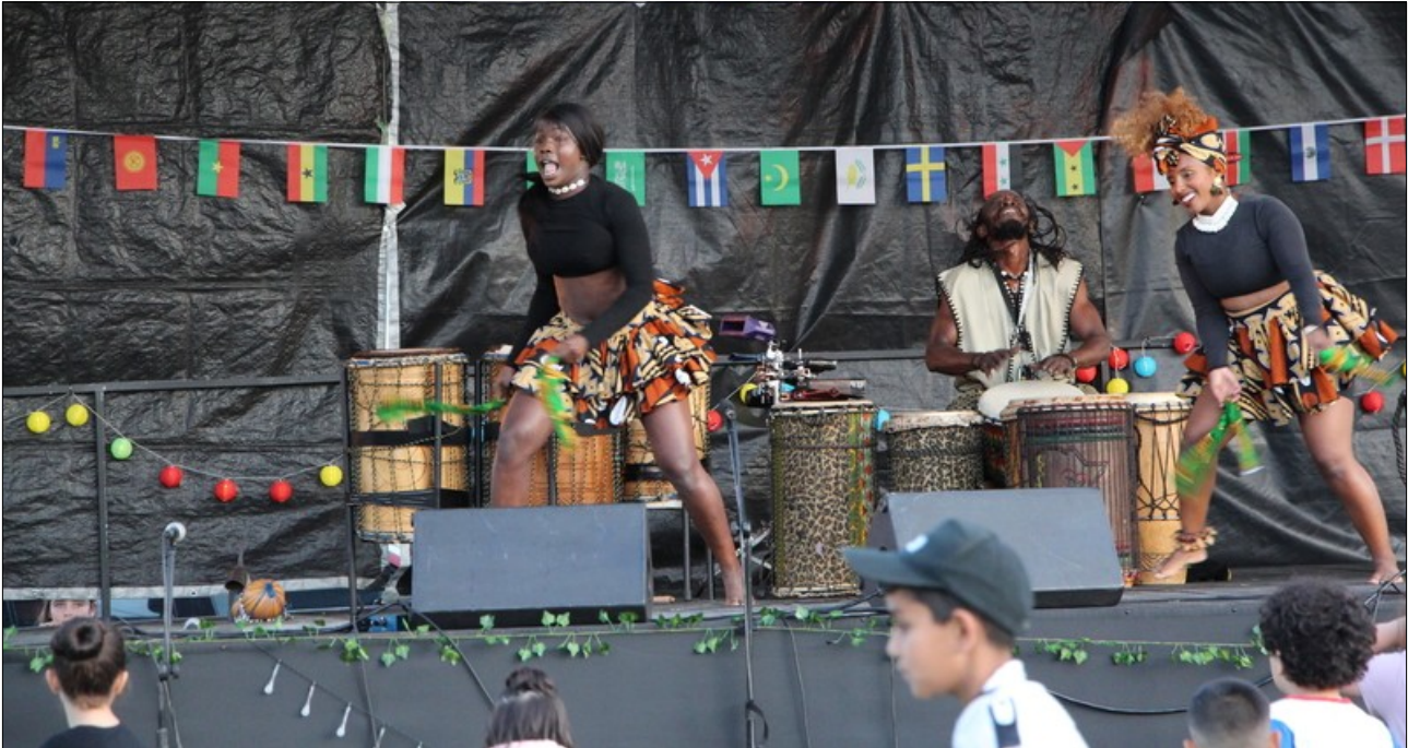
Above: African Fusion representing nations across African performed with their live drum dance.