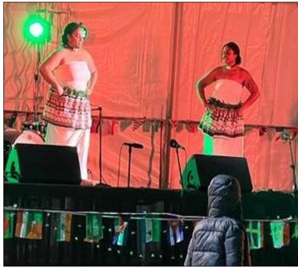
The classical Kathak dance (above left) was performed for the first time. The traditional Fiji Dance was showcased by the Fiji community (above right). Below: The Chinese Dragon workshop attracted many takers as they danced the dragon through the Fiesta grounds.