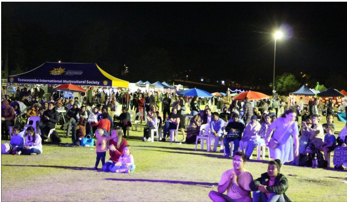
The public stayed till late enjoying the performances and the fireworks display at the end.